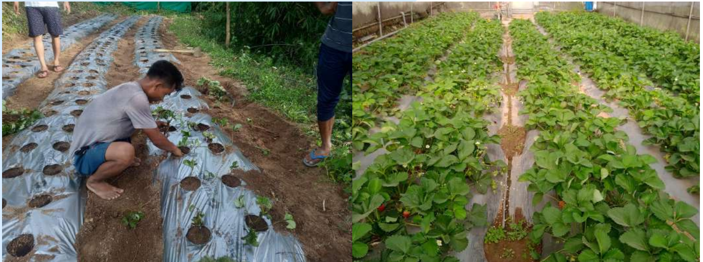
Hands on Training in Transplantation of Sweet Variety of Strawberry at Farmer's Field

Pilot Scale Demonstration of Strawberry Cultivation with Sustainable Agro-technological Interventions in Farmers Field of Meghalaya: A Training was conducted for farmers in September 2021 for planting of sweet strawberry plants in the raised beds with soil moisture and weed management technology. The farmers provided trainings for harvesting quality runners from the previous year's crop.