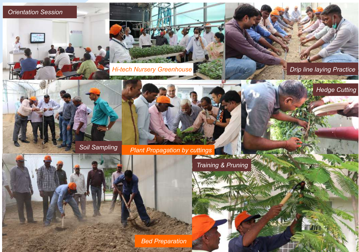
Hands on Training for the gardeners of American Embassy in IHT's Technology Park

The embassy deputed its Gardeners to the IHT, a premier Institute for imparting hands on trainings to the Gardeners and other landscape staff. IHT organized 2 weeks training programme for the all the embassy gardeners of Delhi on “Modern Gardening Practices”. These trainings covered all the major areas necessary for laying to the mainteneance of the gradens and was very well received and acclaimed by the participants including their seniors incharges.