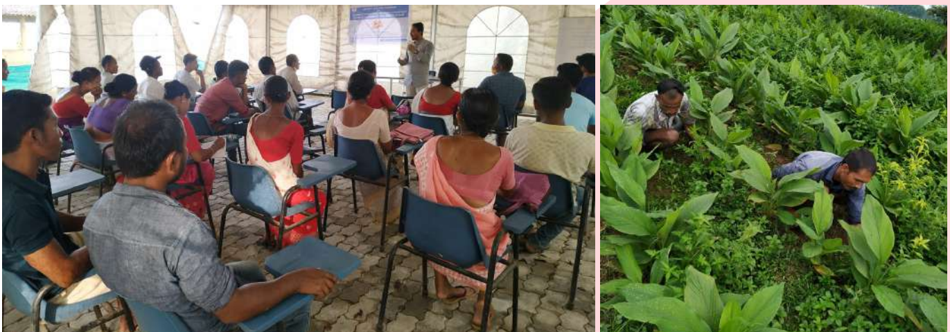
Interactive Lectures and Hands on Training in Turmeric Production for High Curcumin Extraction under GAP in Collaboration with Department of Biotechnology (DBT, Govt. of India)

For standardization of the agro technologies turmeric cultivation with technological interventions, the farmers were provided trainings in the modern cultivation practices for turmeric cultivation.